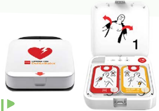
Public Access Solutions