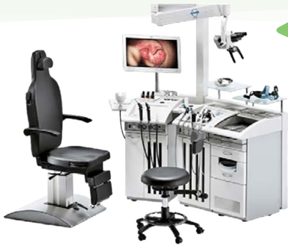
CCS (Clinical Care Solutions)