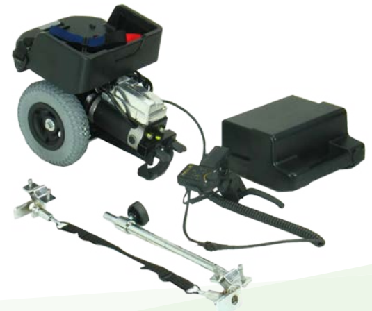
Wheelchair Pushing Aid PowerStroll ↑