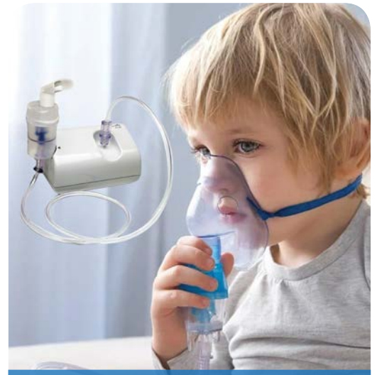
Respirators and Nebulizers