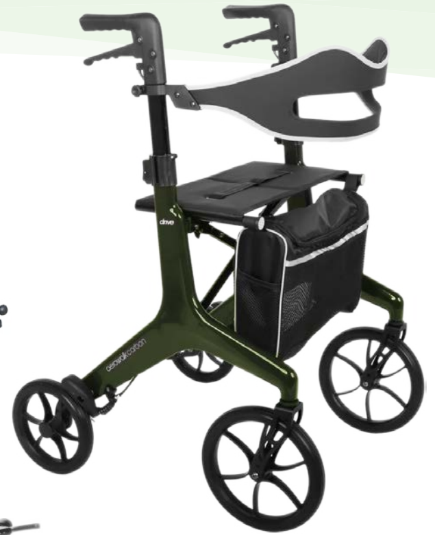
Premium Rollator AeroWalk