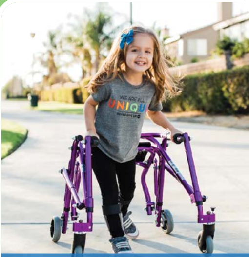
Special Needs People Supplies