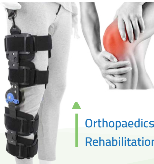
Orthopaedics and Rehabilitation Care