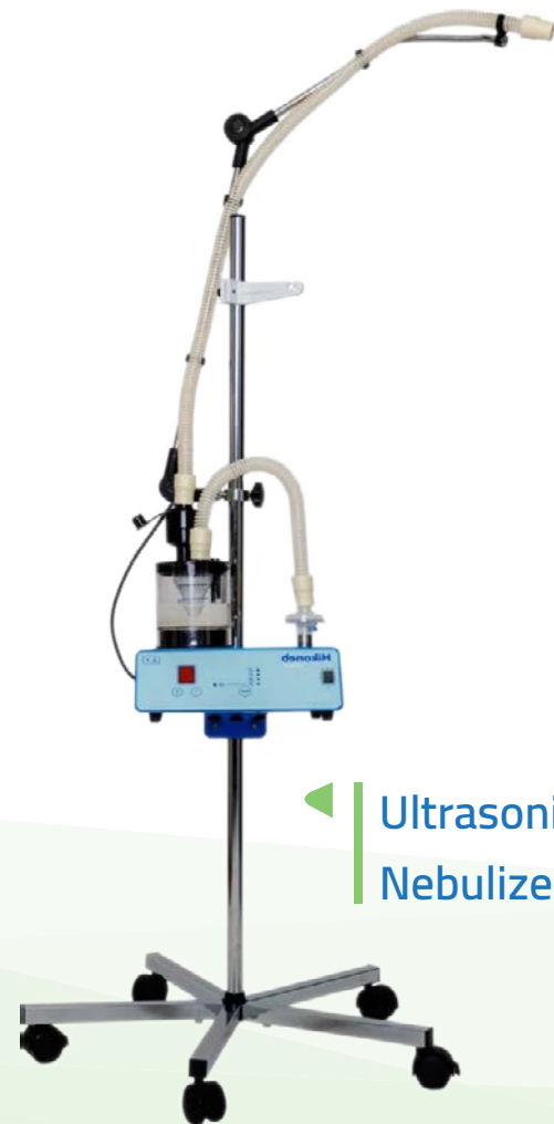
◀ Ultrasonic Nebulizer Hikoneb