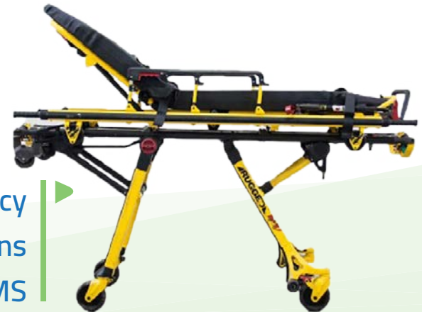
Emergency Medical Solutions - EMS