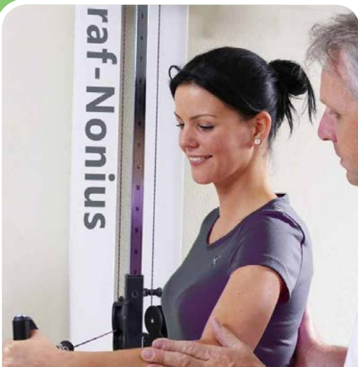
Physical Therapy Devices