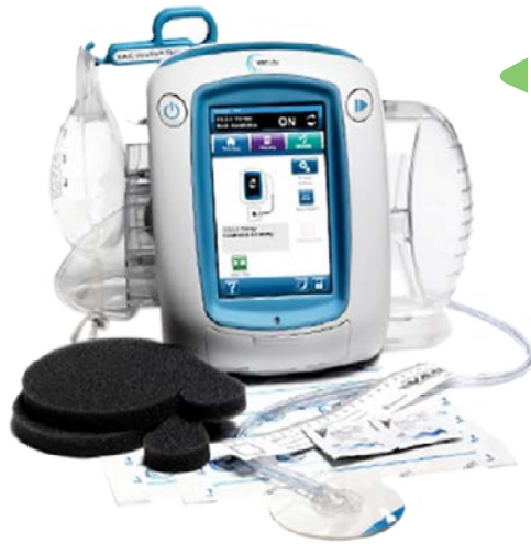
Wound Care Solutions

All of our products and solutions are provided by world-class suppliers, and our professional representatives fully understand the value. We also strive to be available on time to help, get the job done, and ensure we are there whenever and wherever needed.