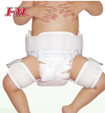
CDH Pediatric Hip Splint