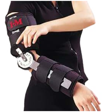
Forearm splint with immobilizer