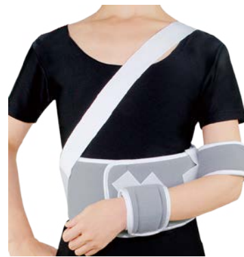
Shoulder & Hand Immobilizer