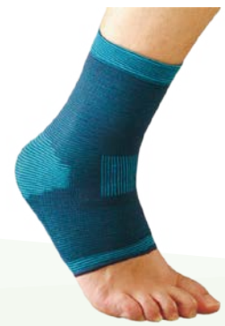
Pattern Ankle Support