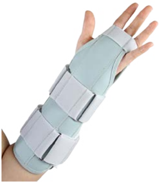
Forearm Splint w2 stays

In MEEZA Medical , we have the most advanced technique in the field of medical disposable, sporting, orthopedic, rehabilitation, and healthcare products. and have it be on sale in many pharmacies & hospitals.