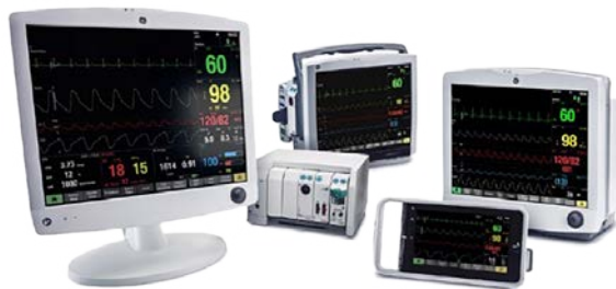
Critical Care Solutions CCU