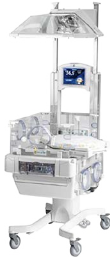
Maternity Infant Care Solutions - MIC