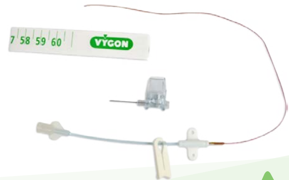
Neonatology and Vascular Access