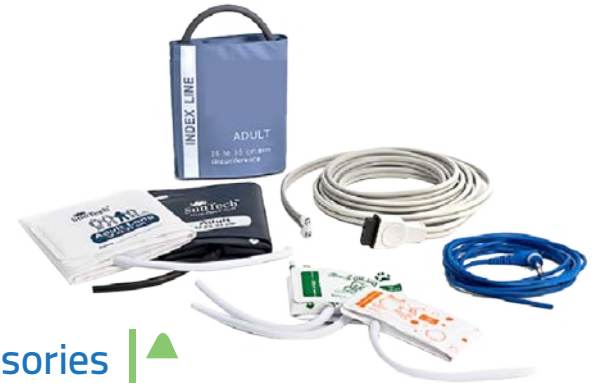
Clinical Accessories & Supplies