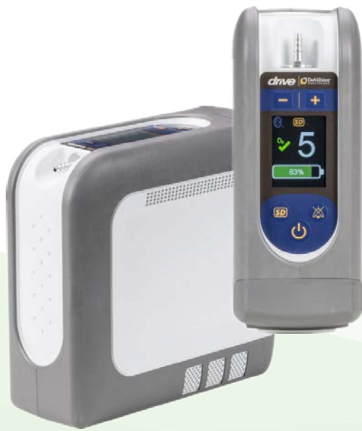
◀ Portable Oxygen Concentrator

The range includes devices for oxygen therapy, extraction therapy, and inhalation therapy.